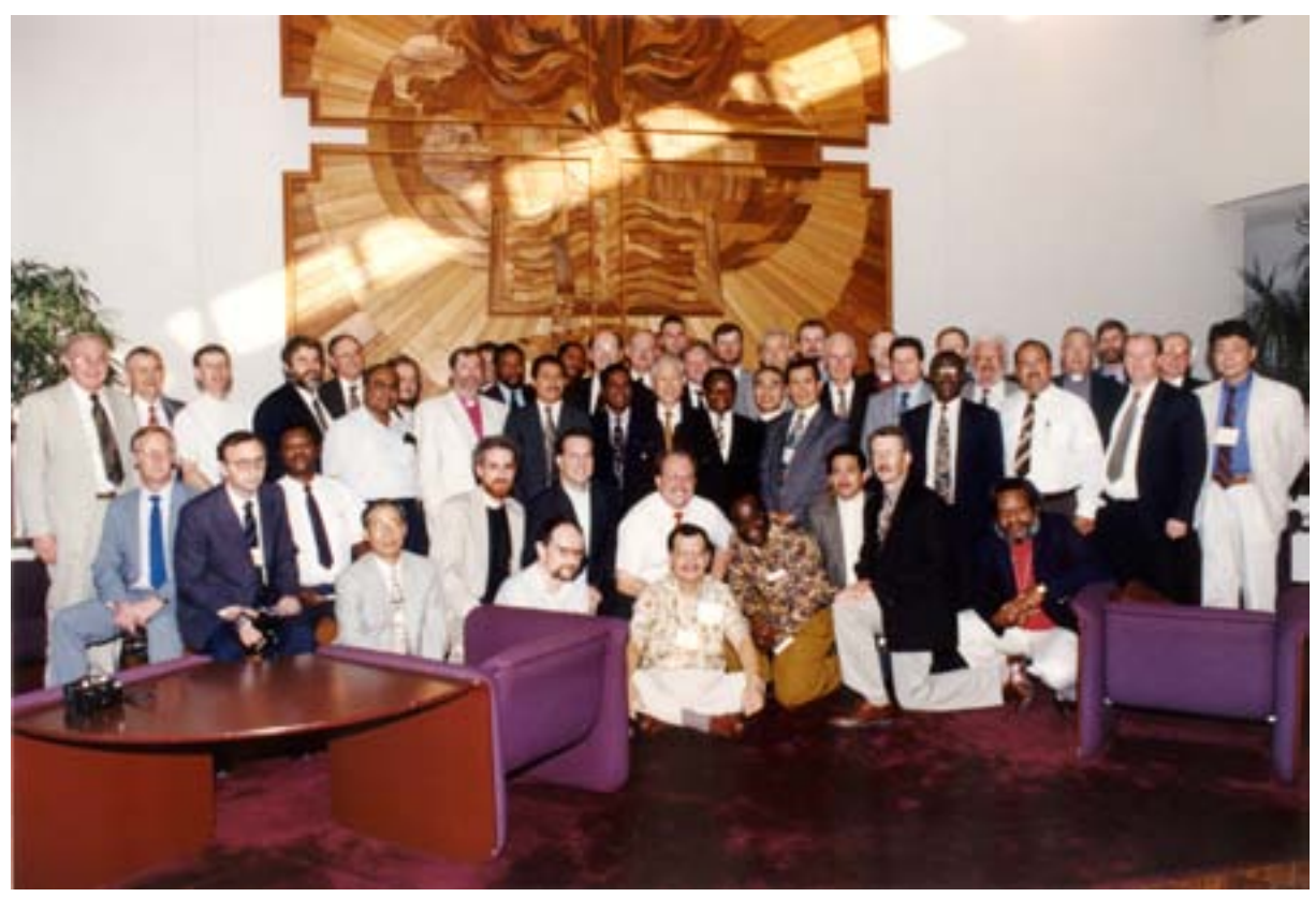
Participants of the ILC Conference 1997 in St. Louis, Missouri, USA