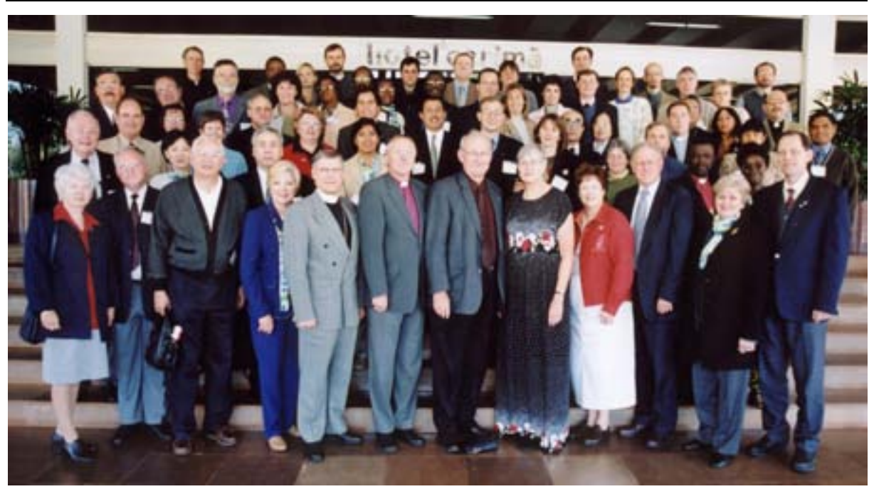
Participants of the 2003 ILC Conference in Foz do Iquaçu, Brazil